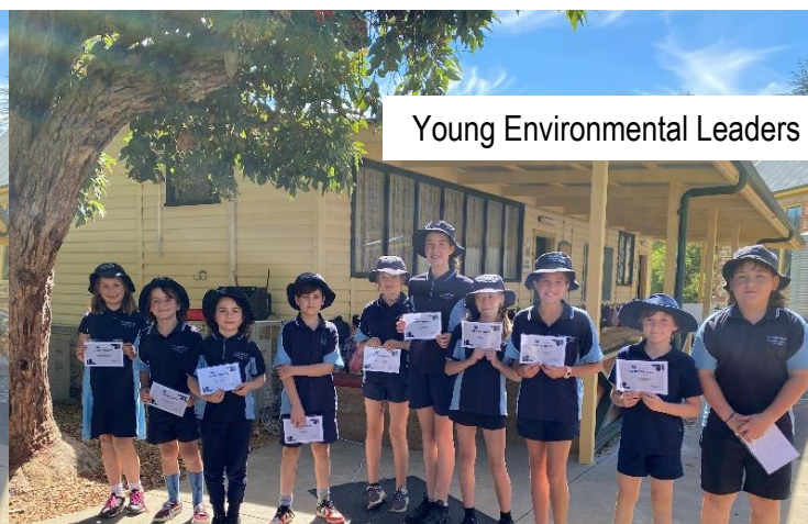
Young Environmental Leaders