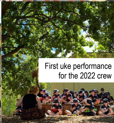
First uke performance for the 2022 crew